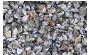
Silver Grey Granite