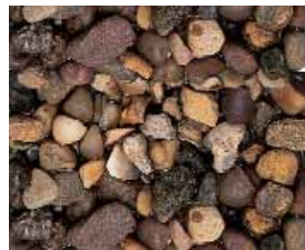
Trent Pea Gravel