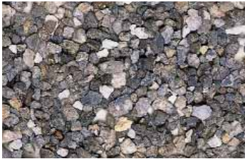
Guyanana Bauxite (Grey)

A wide selection of high performance bauxites, granites and basalts, are available for anti-skid surfacing and traffic management schemes. These products are suitable for heavily trafficked areas, because of their hard wearing and skid resistance properties. Areas of application include, surfacing of major roads, roundabouts, demarcation lanes, paths and cycle ways.