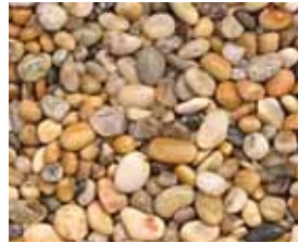
Golden Pea Gravel