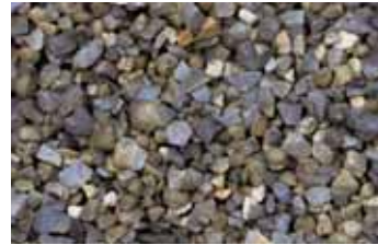
Chinese Bauxite (Grey)