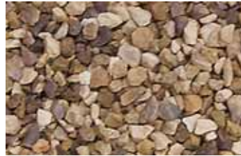
Chinese Bauxite (Buff)