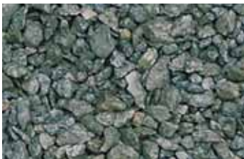
Dark Green Basalt