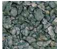
Dark Green Basalt