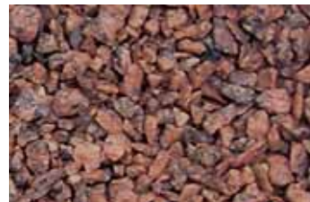
Salmon Pink Granite